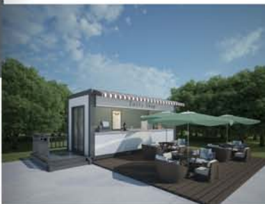
Coffee shop YMCTNS-002