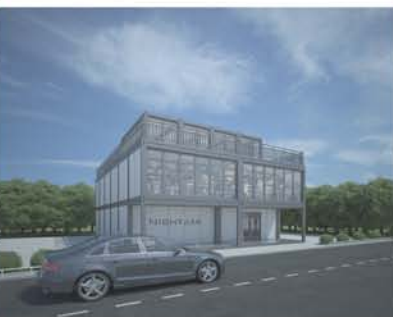
Beverage shop YMCTNS-008