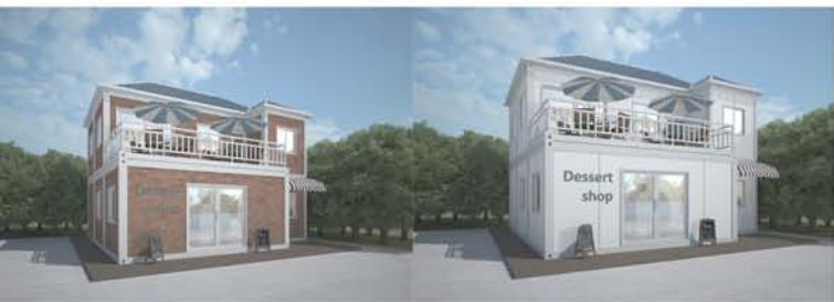
Dessert store, YMCTNS-009