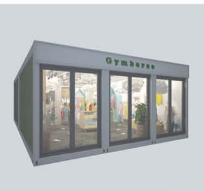
Children's clothing store YMCTNS-010