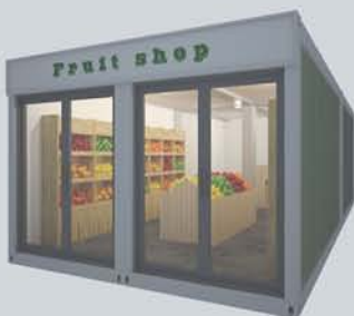
Fruit shop YMCTNS-011